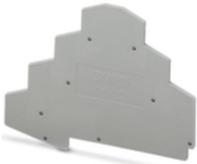
End cover, length: 98.5 mm, width: 2.2 mm, height: 73 mm, color: gray

Please be informed that the data shown in this PDF Document is generated from our Online Catalog. Please find the complete data in the user's documentation. Our General Terms of Use for Downloads are valid ( http://phoenixcontact.com/download )